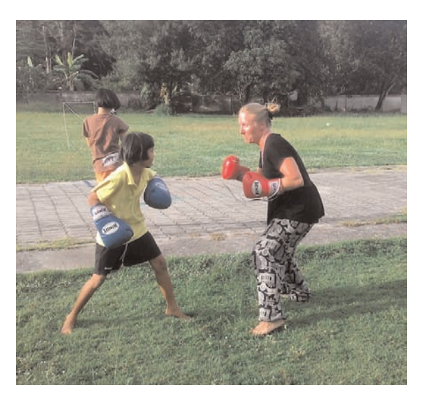
Who needs a gym when you can do some boxing with the kids?