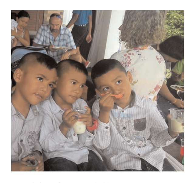
...and these three guys do like ice cream.