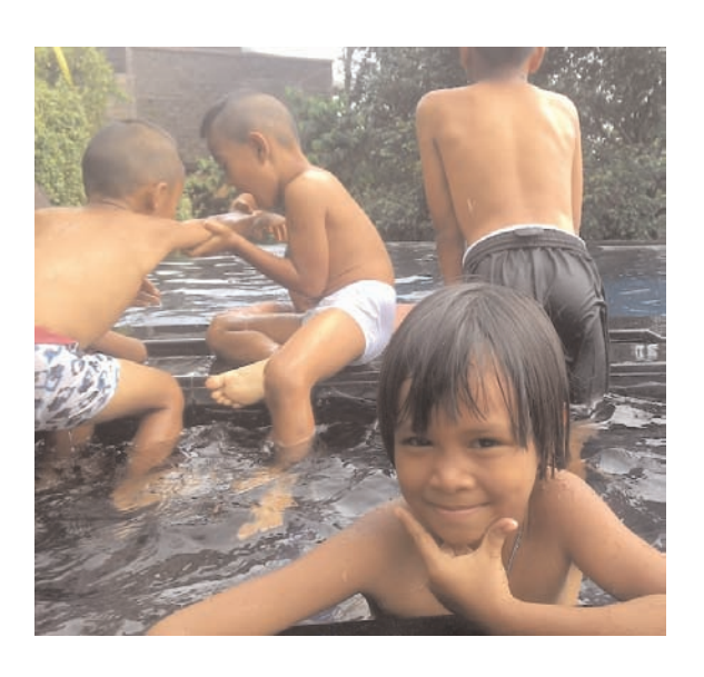
Posing for the camera in the pool.