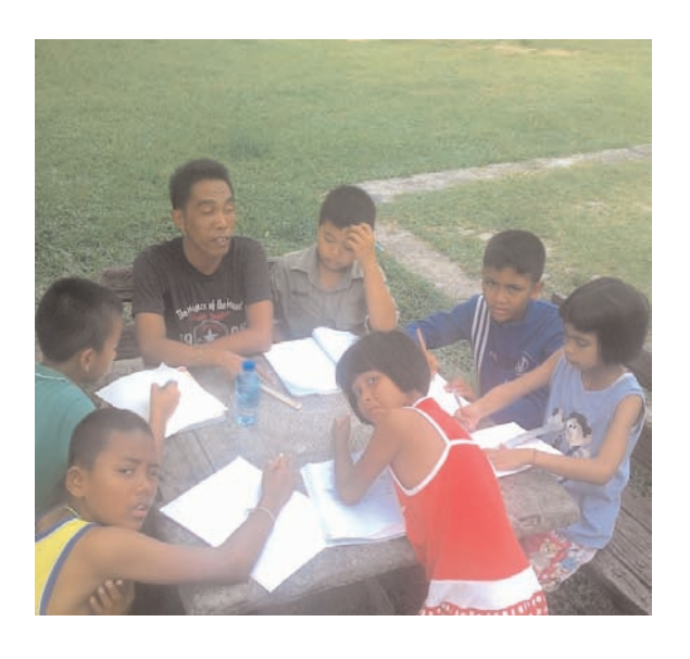
Those who are a bit older are also doing their homework.