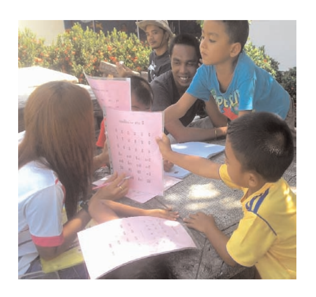
Our youngest ones are doing their homework.