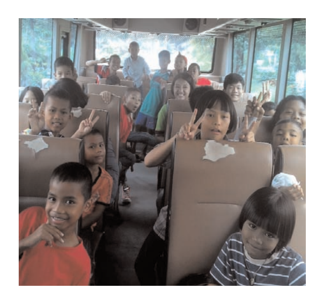
En route to Paresa.