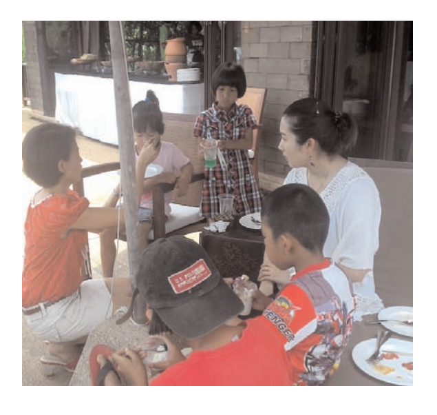
We were served lots of good food and Bai-Tuy even got some personal assistance.