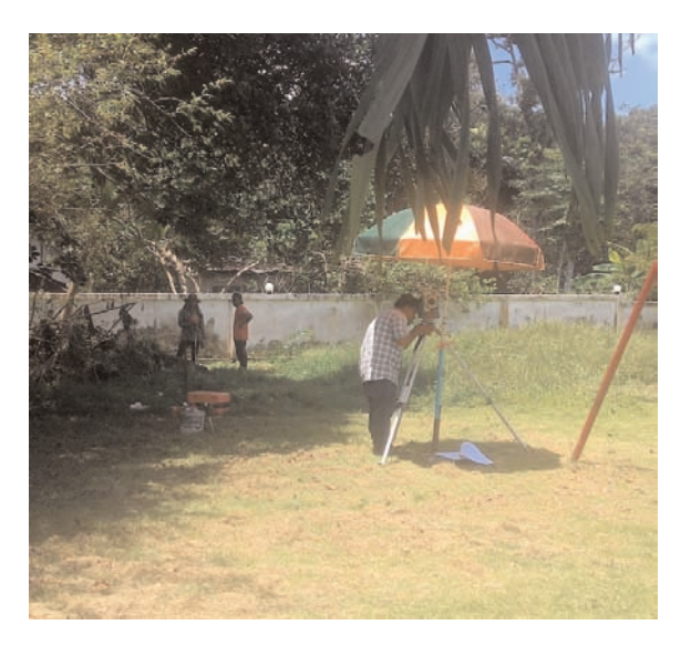
And now it's under way! For the next several months to come, this site probably won't be this calm.