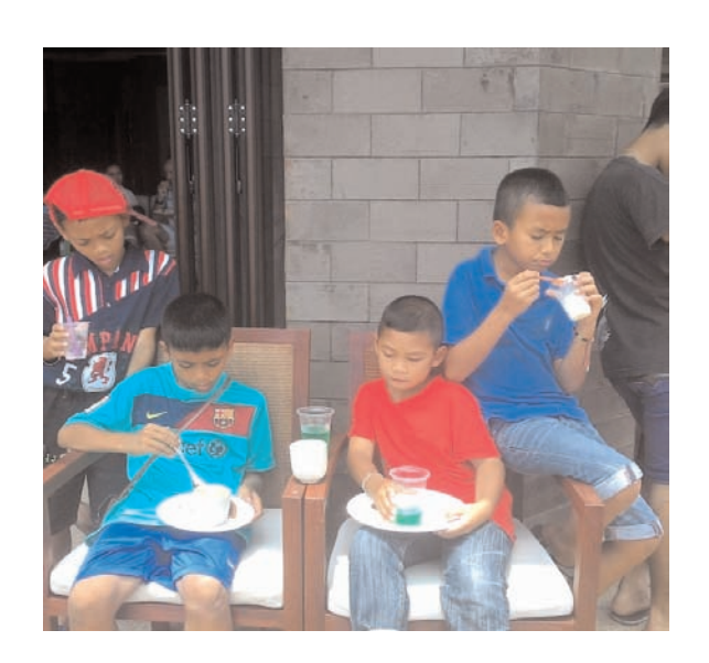
The lovely meal was followed by ice cream...