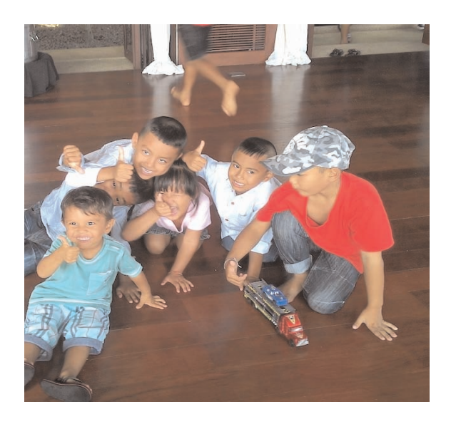
After having enjoyed food, candy and water fun, you can always switch to playing with cars.