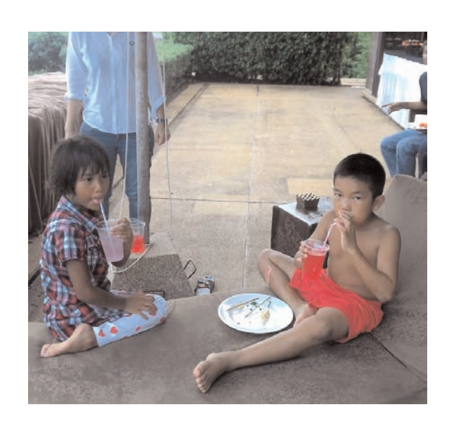
Wet fun wets your appetite.