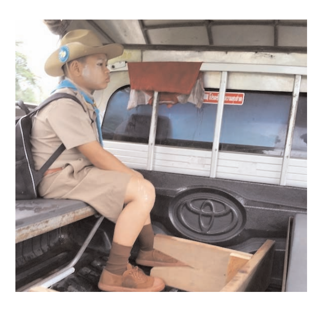
Not quite awake yet, but off to school.