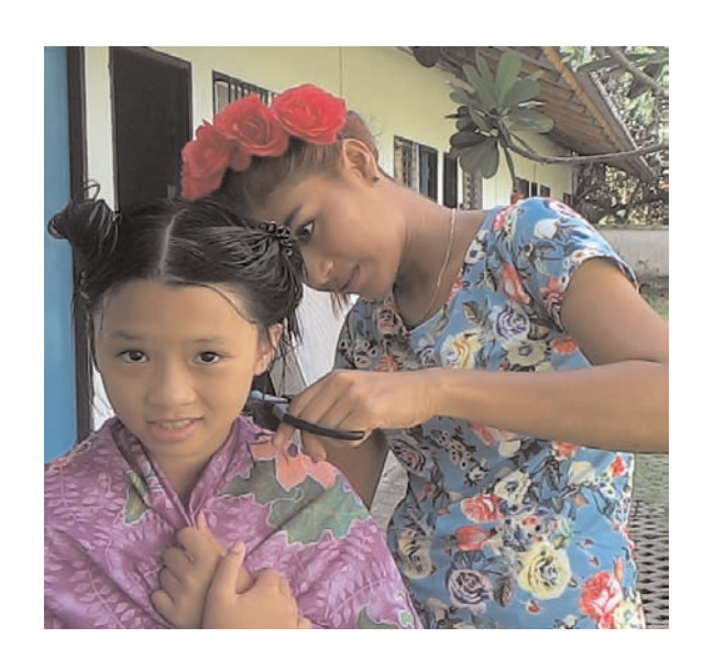
Nid takes care of the school hair-do.