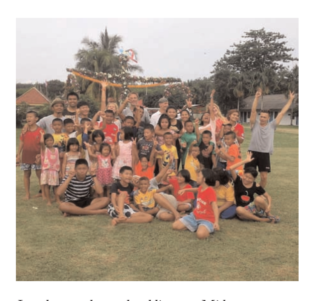
Last but not least, the obligatory Midsummer photo.