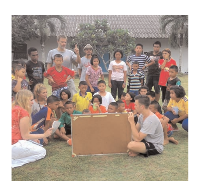
Reviewing the Midsummer games.