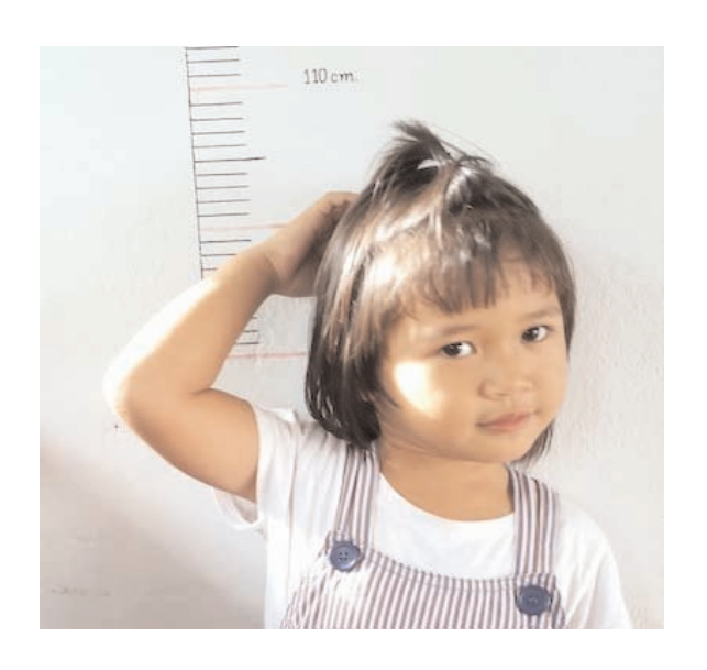
She's growing, she's growing!!