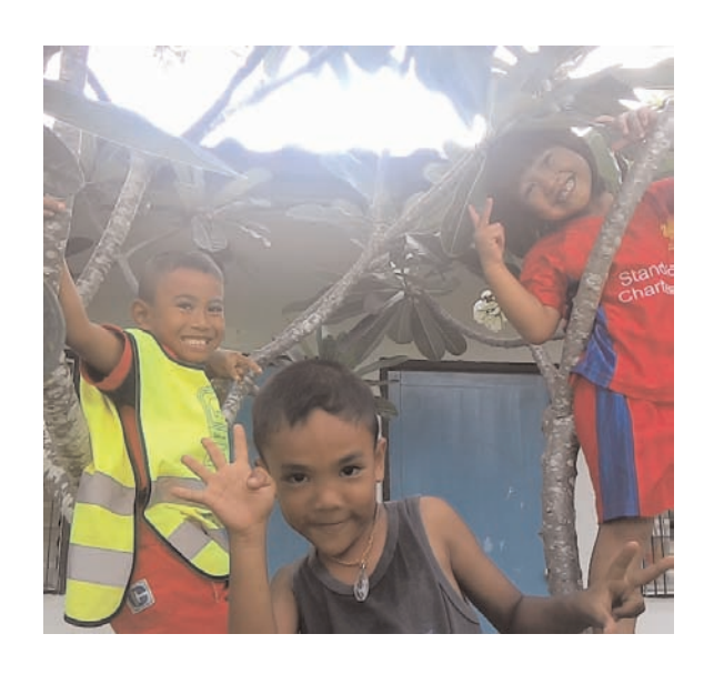
New and old cute little monkeys!