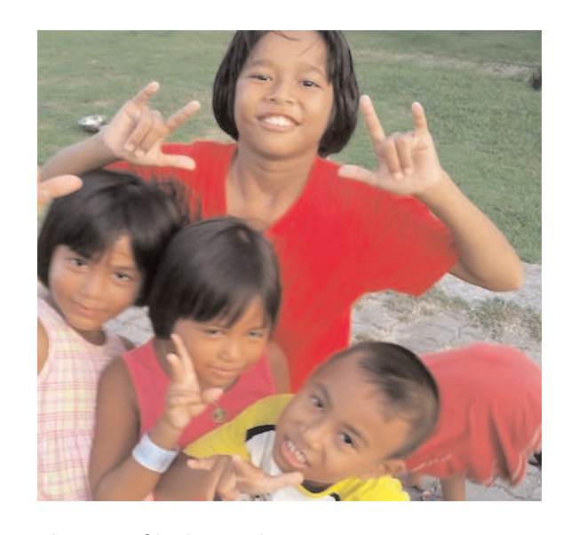
A group of little rascals.