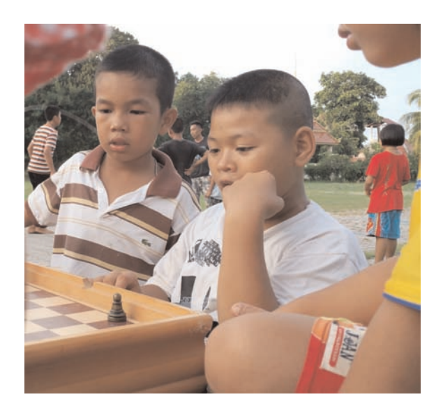
Two masters at chess.