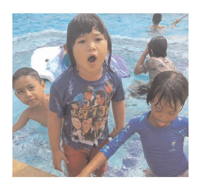
Fun in the pool.