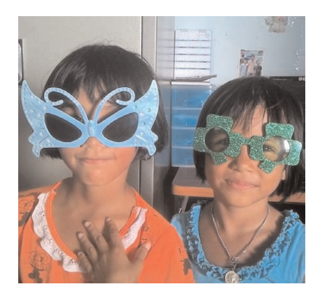
Two friends who enjoy playing masquerade and dress-up.